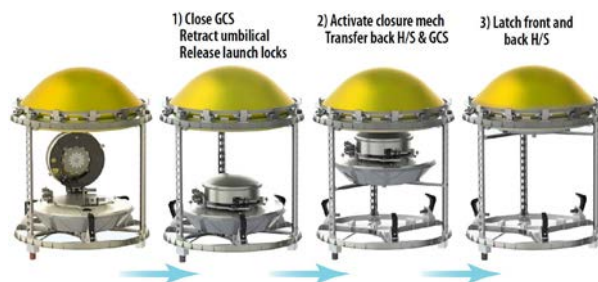
Figure 3. SRC preparation sequence just before reentry.

The CAESAR design and systems maintain the SCS and GCS below 0^\circ\text{C} throughout entry, descent, landing and recovery under worst-case landing site temperature and recovery conditions, fulfilling all mission requirements to preserve the returned comet solids and volatiles.